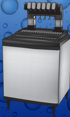
Soft Drink Dispenser